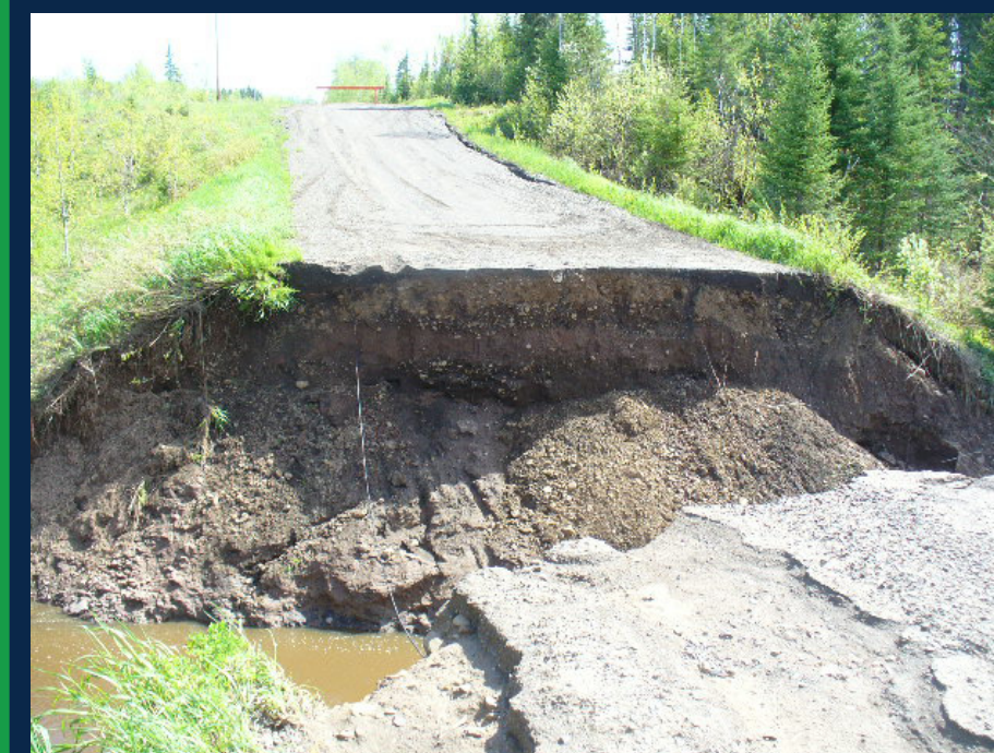
Damage caused by flooding in 2008.

The LRCA also conducts snow surveys between November and May of each year. Snow depth and weight (water content) are collected and forwarded to MNR's Surface Water Monitoring Centre as part of the Flood Forecasting Program.