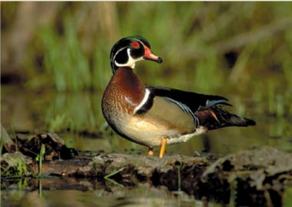
Healthy wetlands attract nesting and migrating waterfowl.