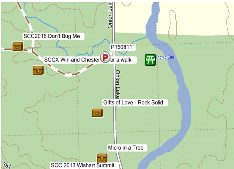
Topographic Map skills such as contour lines and scale can be integrated with an optional classroom extension.