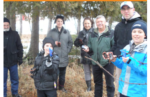
Students work in pairs learning GPS navigation skills